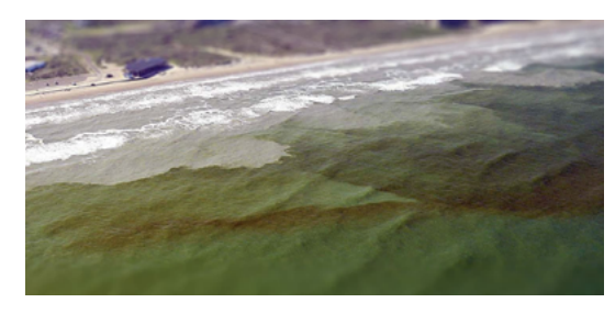
Blooms of harmful algae, like this "red tide" off the coast of Texas, can cause illness and death in humans and animals.

VIIRS helps water resource managers decide where to sample to verify the presence of harmful algae and is used in NOAA's Harmful Algal Bloom Operational Forecast System to provide advance warning of potential blooms.